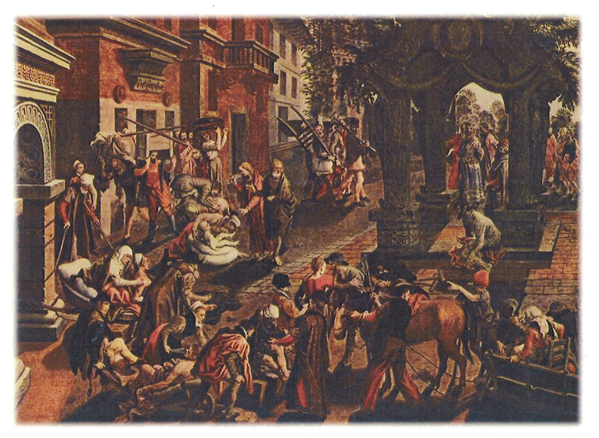
The Twelve drove out many demons, and they anointed with oil many who were sick and cured them.

1001 State Highway A, New Hamburg, MO — PO Box 247, Benton, Missouri 63736 Phone: 573-545-3317 Website: www.stlnh.org